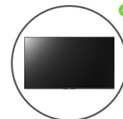
Large LED TV Display