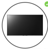
Large LED TV Display