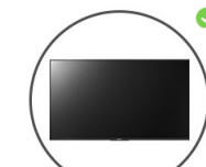
Large LED TV Display