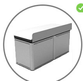
Lectern - Double