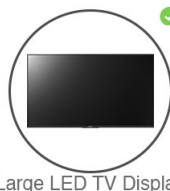
Large LED TV Display