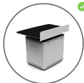
Lectern - Single