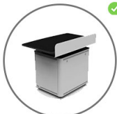
Lectern - Single