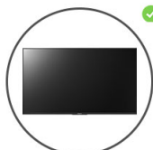
Large LED TV Display