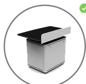
Lectern - Single