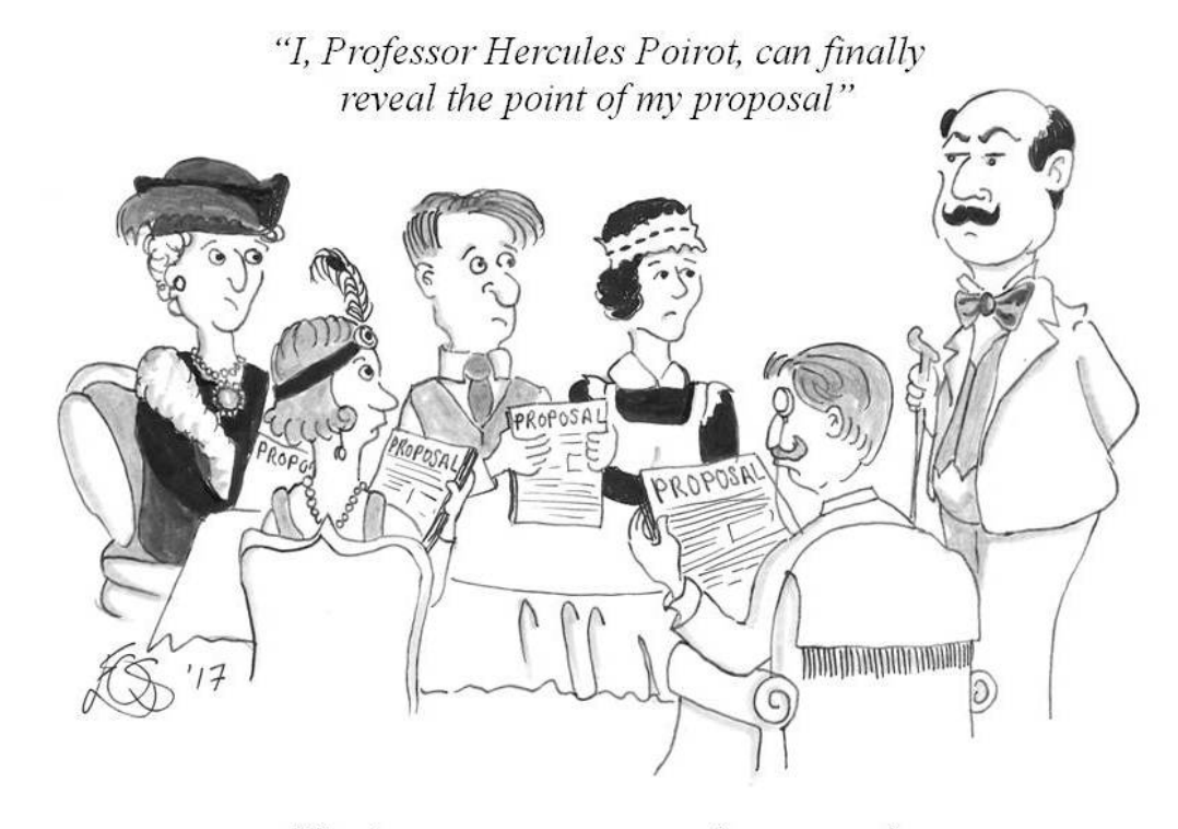
The 'mystery suspense' proposal