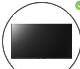
Large LED TV Display