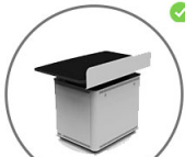
Lectern - Single