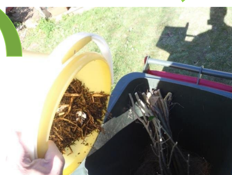
Empty the full poo bucket into your recycling wheelie bin