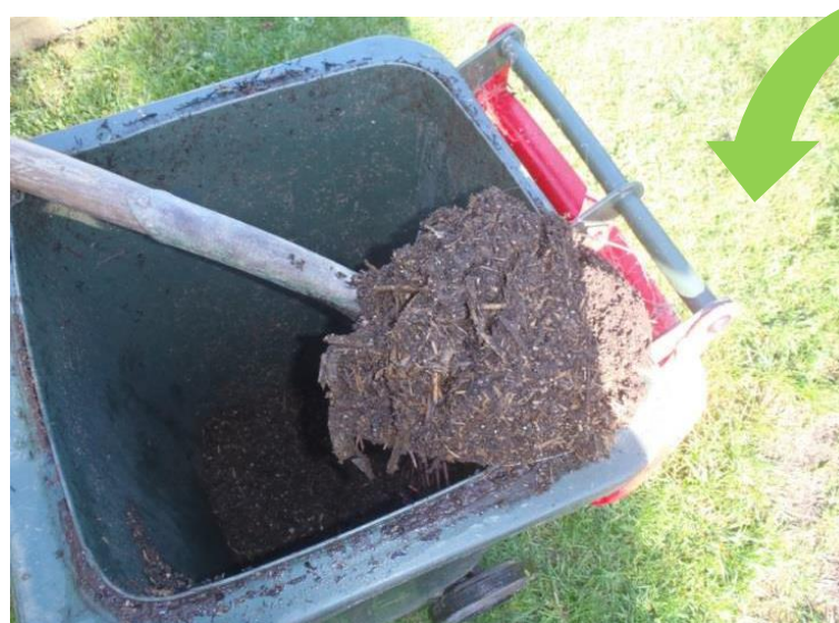
Treat the poo to reduce or eliminate pathogens