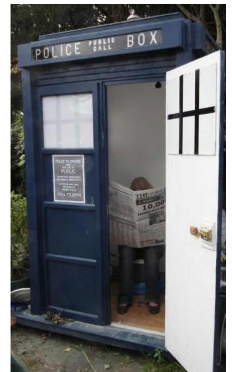
The TURDIS: Emergency backyard long drop following the Christchurch earthquake, 2011